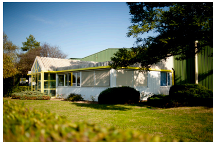
SED La Flèche (72)