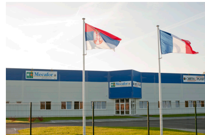
MECAFOR Kikinda (Serbie)