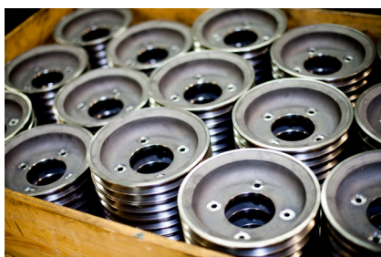
27 CNC LATHES