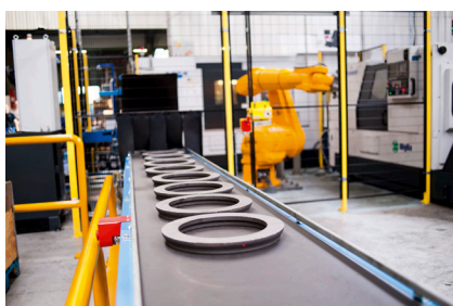
8 ROBOTIC CELLS