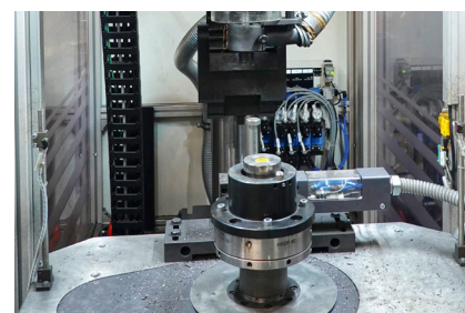
5 BALANCING MACHINES

BROACHING, LEAK TIGHTNESS INSPECTION, CLEANLINESS CONTROL