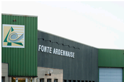
LFA2 Vrigne aux Bois (08)