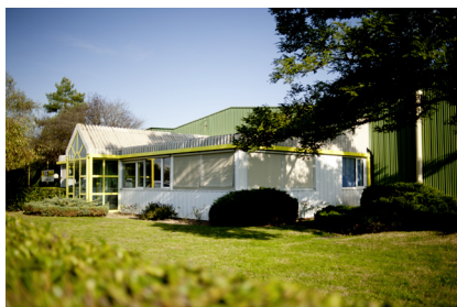
SED La Flèche (72)