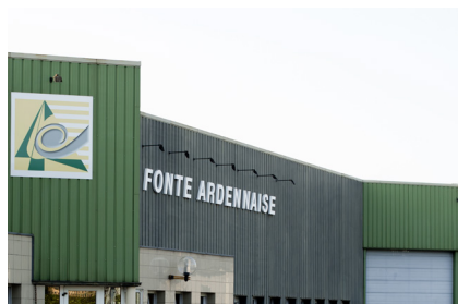
LFA2 Vrigne aux Bois (08)