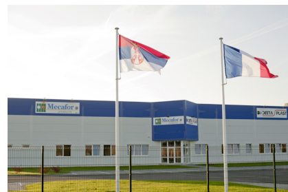
MECAFOR Kikinda (Serbie)